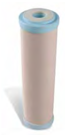
STERILIZING CARTRIDGES D.O.E. series MCA

Note: Max water flow rate at 20°C and diferencial pressure 0,15 bar