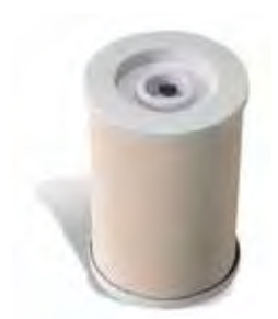
CERAMIC AND ACTIVE CARBON CARTRIDGES FOR AQUA SELECT